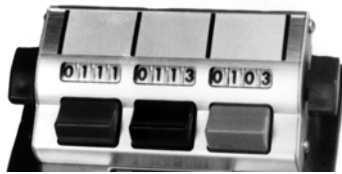
Three Unit Counter (1 x 3)