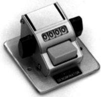
Single Unit Counter (1 x 1)

Small assemblies are used in school cafeterias to provide the required data for food subsidy claim reports. In hospital cafeterias, in addition to food counts, they are used for personnel classification counts: doctors, interns, nurses, guests and staff servings. Such counts are important for cost allocation or budgetary purposes.