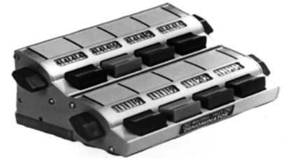
Eight Unit Counter (2 x 4)

Small assemblies are used in school cafeterias to provide the required data for food subsidy claim reports. In hospital cafeterias, in addition to food counts, they are used for personnel classification counts: doctors, interns, nurses, guests and staff servings. Such counts are important for cost allocation or budgetary purposes.